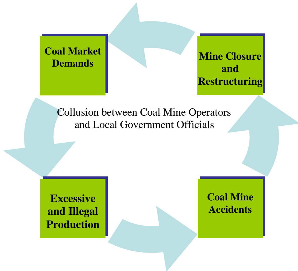
Table 3. The web of collusion and the cycle of coal mine accidents