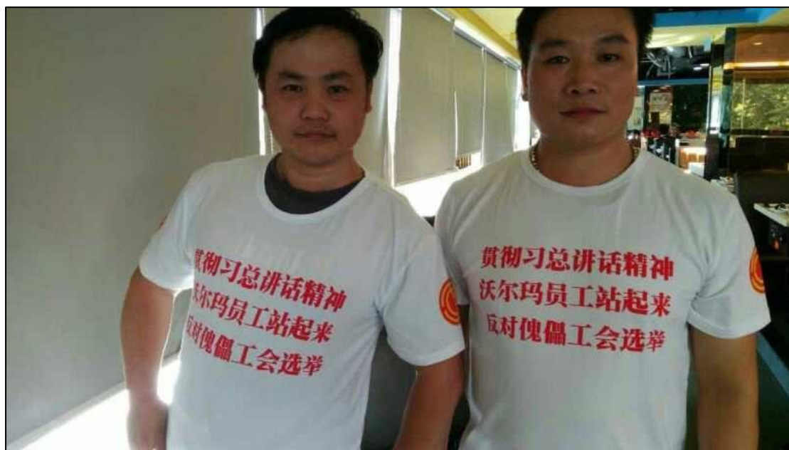
Walmart worker activists make their point: 'Implement the spirit of General Secretary Xi Jinping's speech, Walmart workers stand up, Oppose puppet trade union elections.'

have seen from the battle of Walmart workers in Changde for fair and just compensation, this is unlikely to happen as long as huge corporations with virtually unlimited resources can put pressure on local governments and courts to rule in their favour. Workers need all the help they can get when faced with corporate giants like Walmart, and it is absolutely essential that the trade union stands firmly on the side of the workers if they are to make any progress.